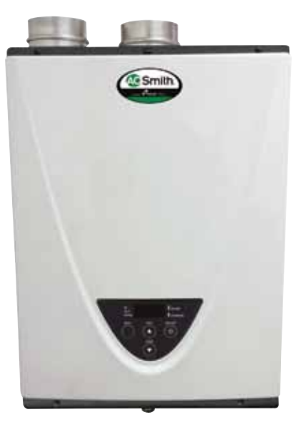
Tankless water heater

Storage tank water heaters cycle on and off throughout the day to maintain the desired water temperature in the tank. "With the efficiencv levels achieved with modern insulation technologies, water heaters may only turn on once or twice in a 24-hour period