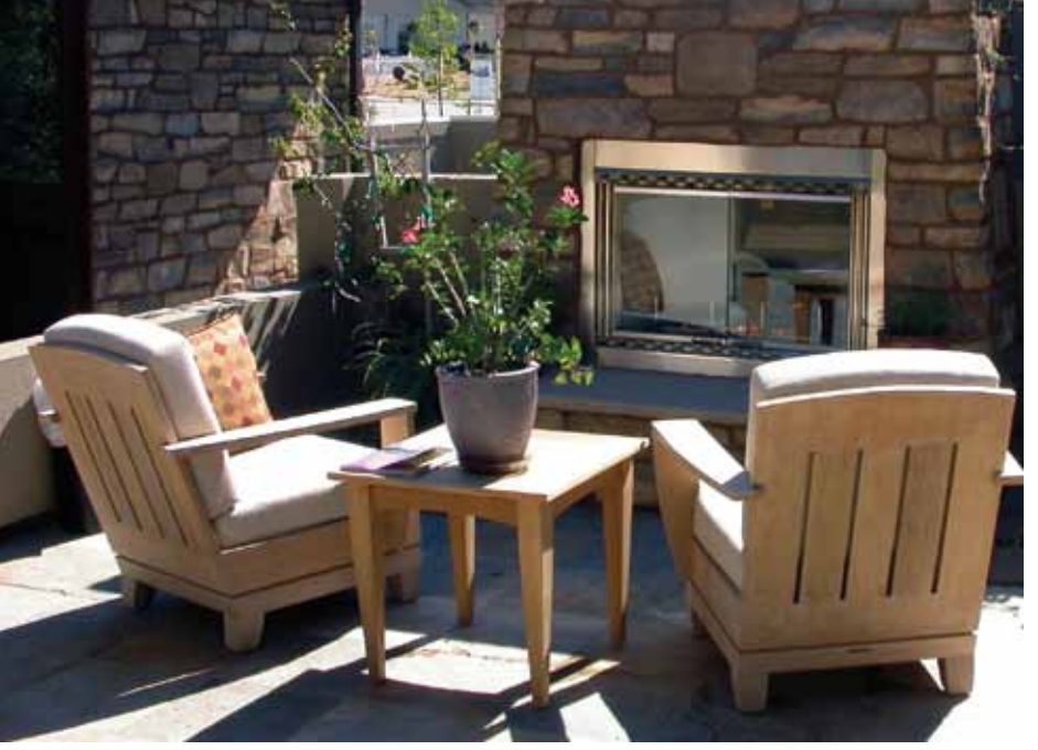
(continued from page 11)